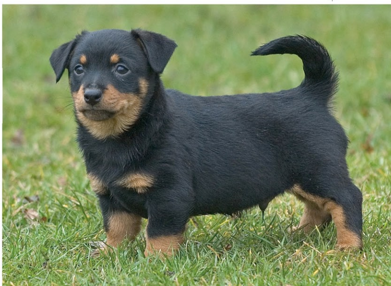
The Lancashire Heeler is not yet recognized by the FCI, yet the breed was present at the 2001 World Show in Portugal.