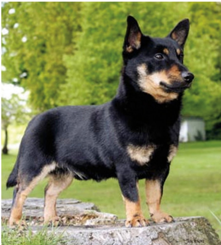
Most Heelers are not suitable for a life in kennels; they are very devoted to people and love their company.

In 1989, The Kennel Club announced that they would no longer accept dogs registered by the breed club and the club's register was closed. A new