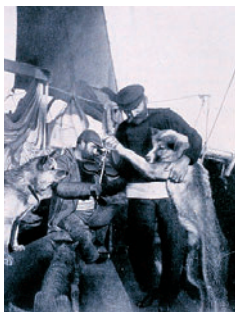
In the absence of female passengers, a member of Amundsen's crew dances with a sled dog (1911).

Was the dancing man happy? Was he a little tipsy? Was he dancing on the street in front of his house? In front of the pub? The beret, set a little obliquely on his head, could indicate that master and dog were dancing outside. Was the dog imitating his master or the other way round? The expression on the man's face is one of concentration and he is looking at his dog.