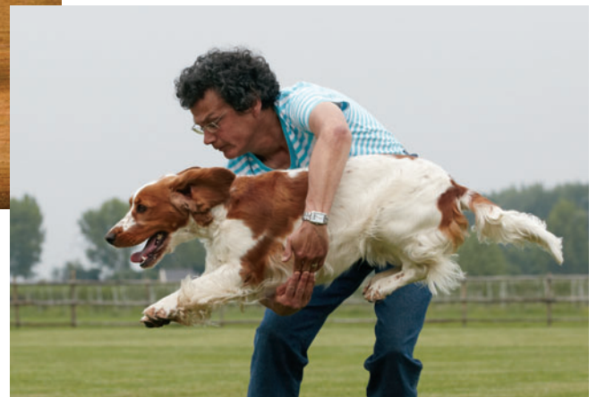
Dog Dancing today is based on mutual respect and trust. The Welsh Springer Spaniel is a member of the old Spioen family.